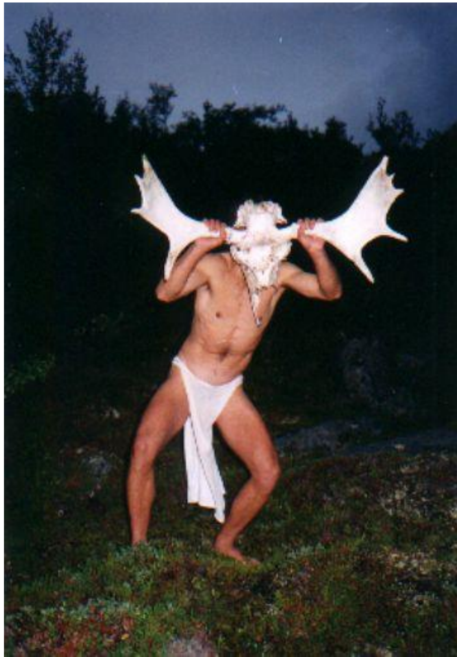
Call of the ancestors, Abisko national park