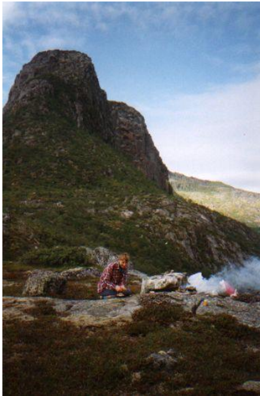
Wild camping in Lofoten