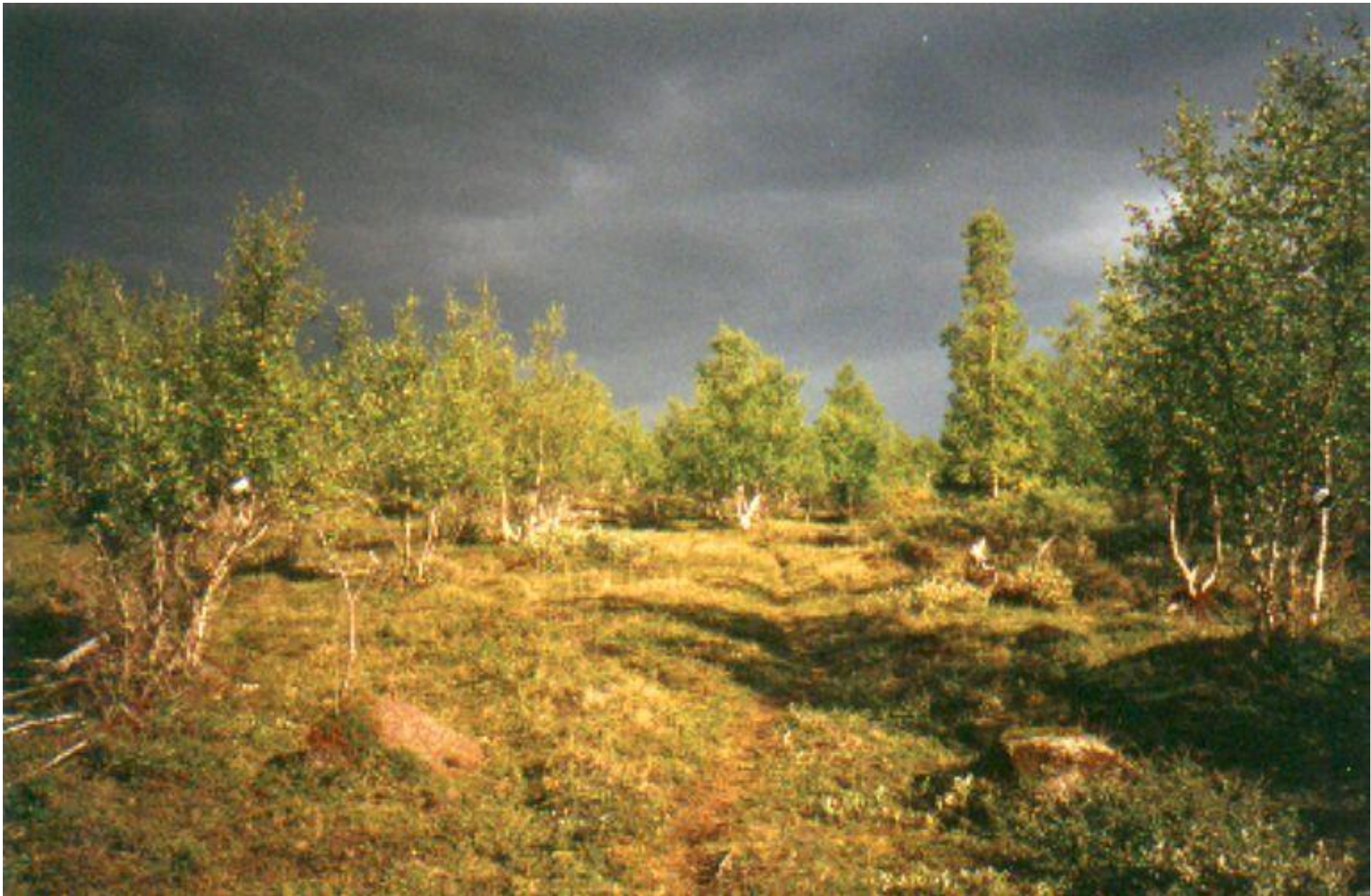
Tundra forest before the storm