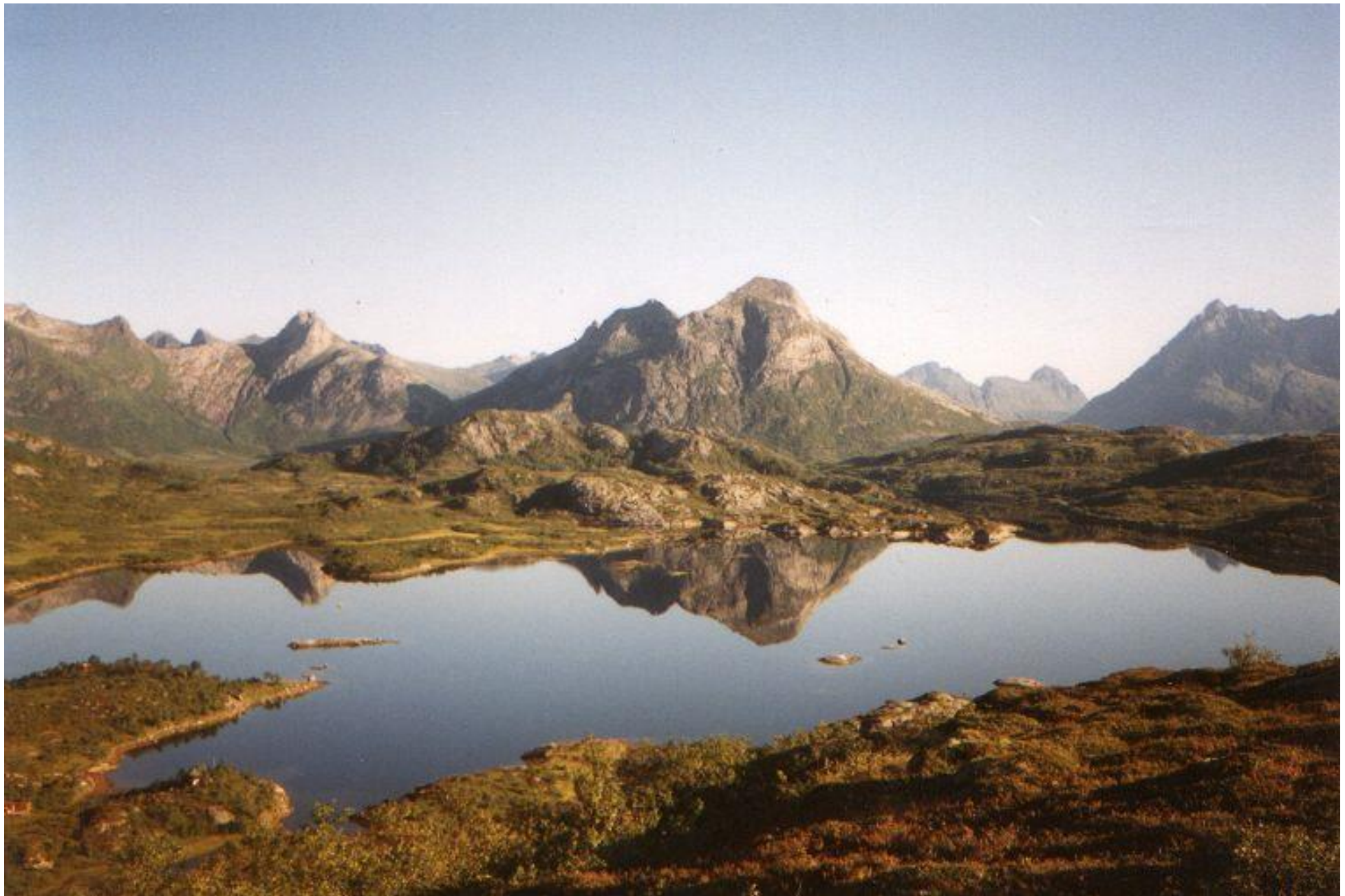
Mirror in Lofoten islands